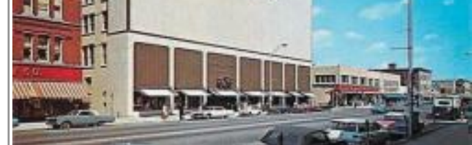
The England Brothers store was a local landmark.

supplies. I can still hear the bell signaling the pneumatic tubes transporting money back and forth from various departments to the back offices.