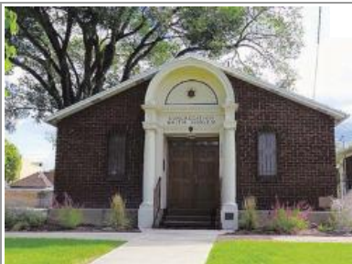
Ogden, Utah's Congregation Brith Sholem, established 1890