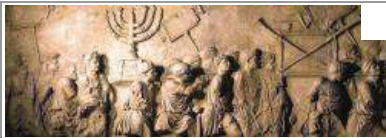
Arch of Titus detail depicting spoils from Jerusalem.