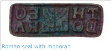
Roman seal with menorah